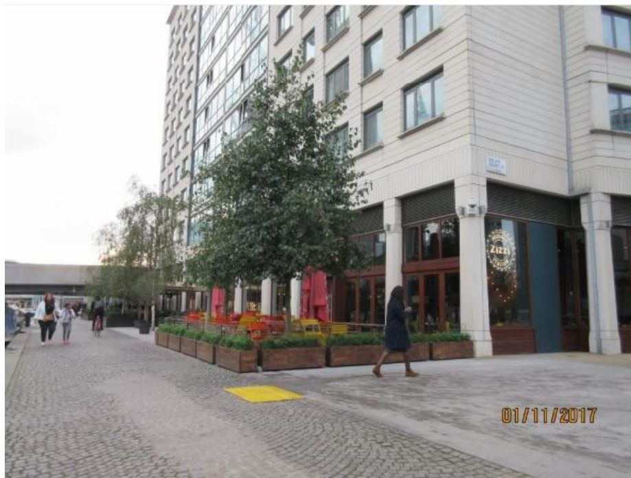
View of tables and chairs area looking north west (top) and looking south east (bottom).